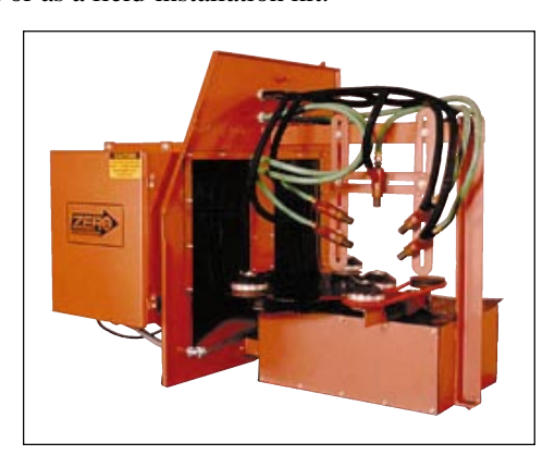
A-300 Automation Kit

The A-250 kit includes a variable-speed rotating fixture and one rack-mounted automatic blast gun. This simple automation accessory can be installed in almost any cabinet and removed when not needed. Perfect for short runs and sample processing.