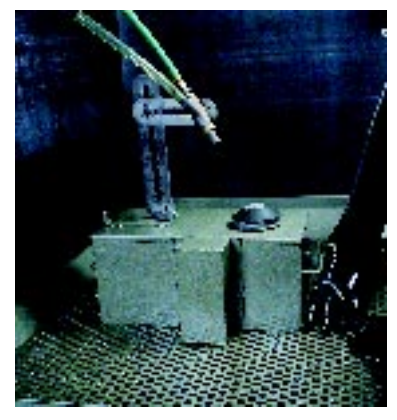
A-250 Automation Kit