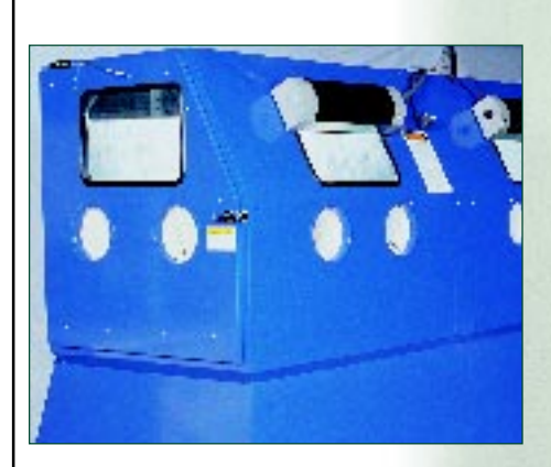
Double Cabinet with additional operator station

Alox Kit includes rubber curtains for cabinet